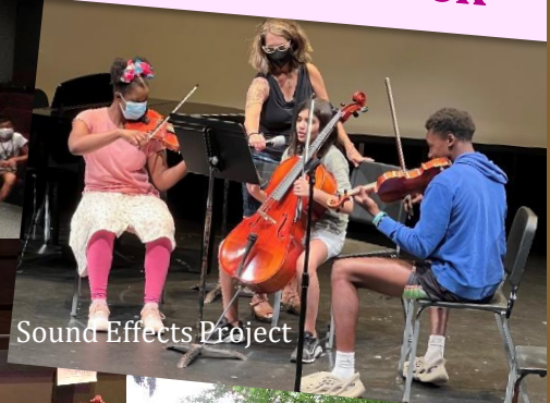
Sound Effects Project