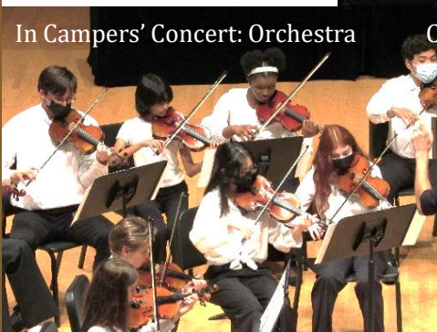
In Campers' Concert: Orchestra