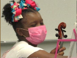
In Chamber Music Coaching