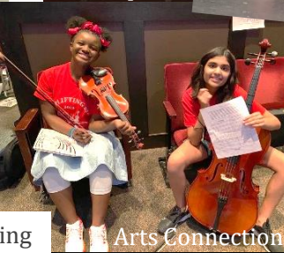
Arts Connections Project