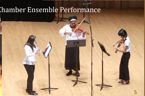
Chamber Ensemble Performance