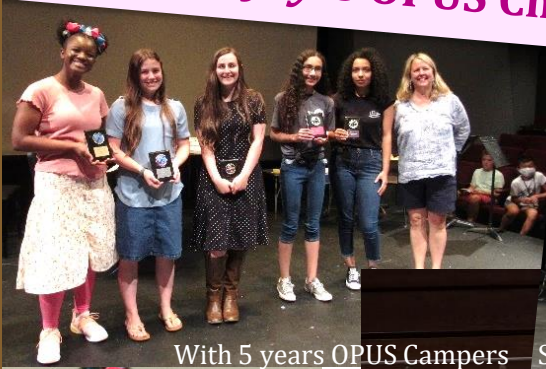
With 5 years OPUS Campers