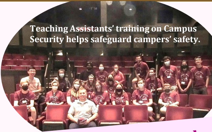
Teaching Assistants' training on Campus Security helps safeguard campers' safety.

The OPUS programs are aimed at encouraging students to improve their musical skills while at the same time growing socially by promoting friendships in an honest and ethical environment.