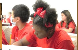
Her 2022 Highlights