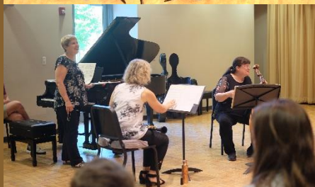
The Orion Ensemble