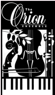
Florentina Ramniceanu , Violin (14)