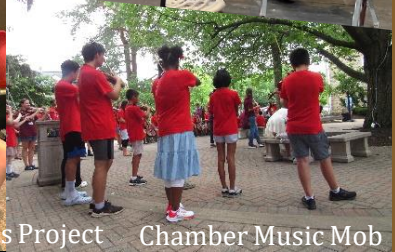
Chamber Music Mob