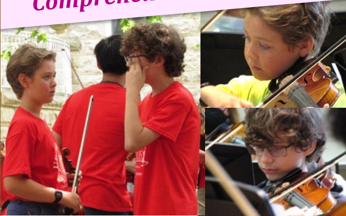
“Is your eye okay?” They met each other at OPUS.

It is the enjoyment of making music together with new friends, rekindling friendships from previous years, and all the camaraderie, character-building, teamwork, cultural appreciation, and chamber musical skill improvements that encourage OPUS Participants to come back year after year.