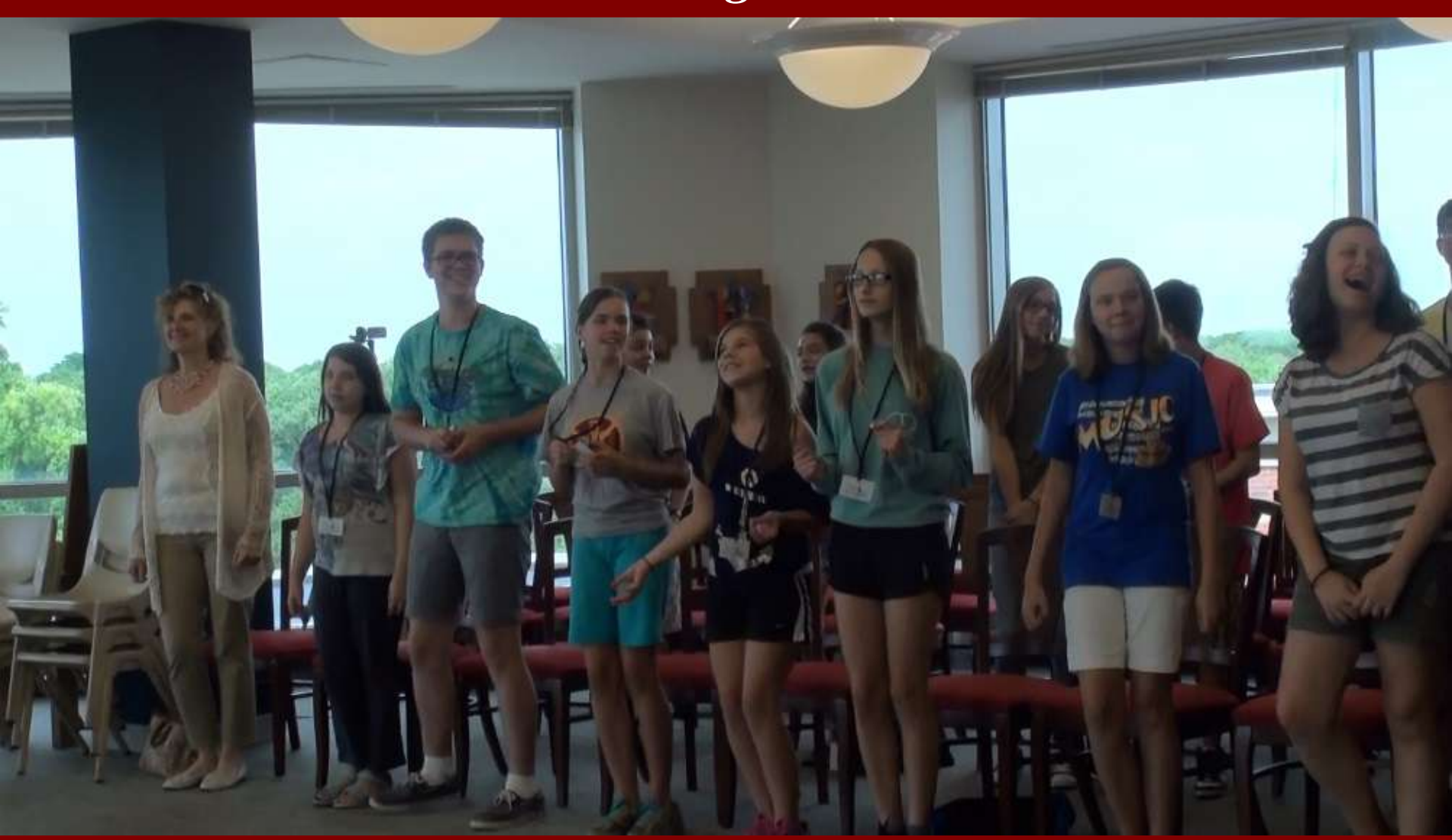
Fresh, flirty and fun!