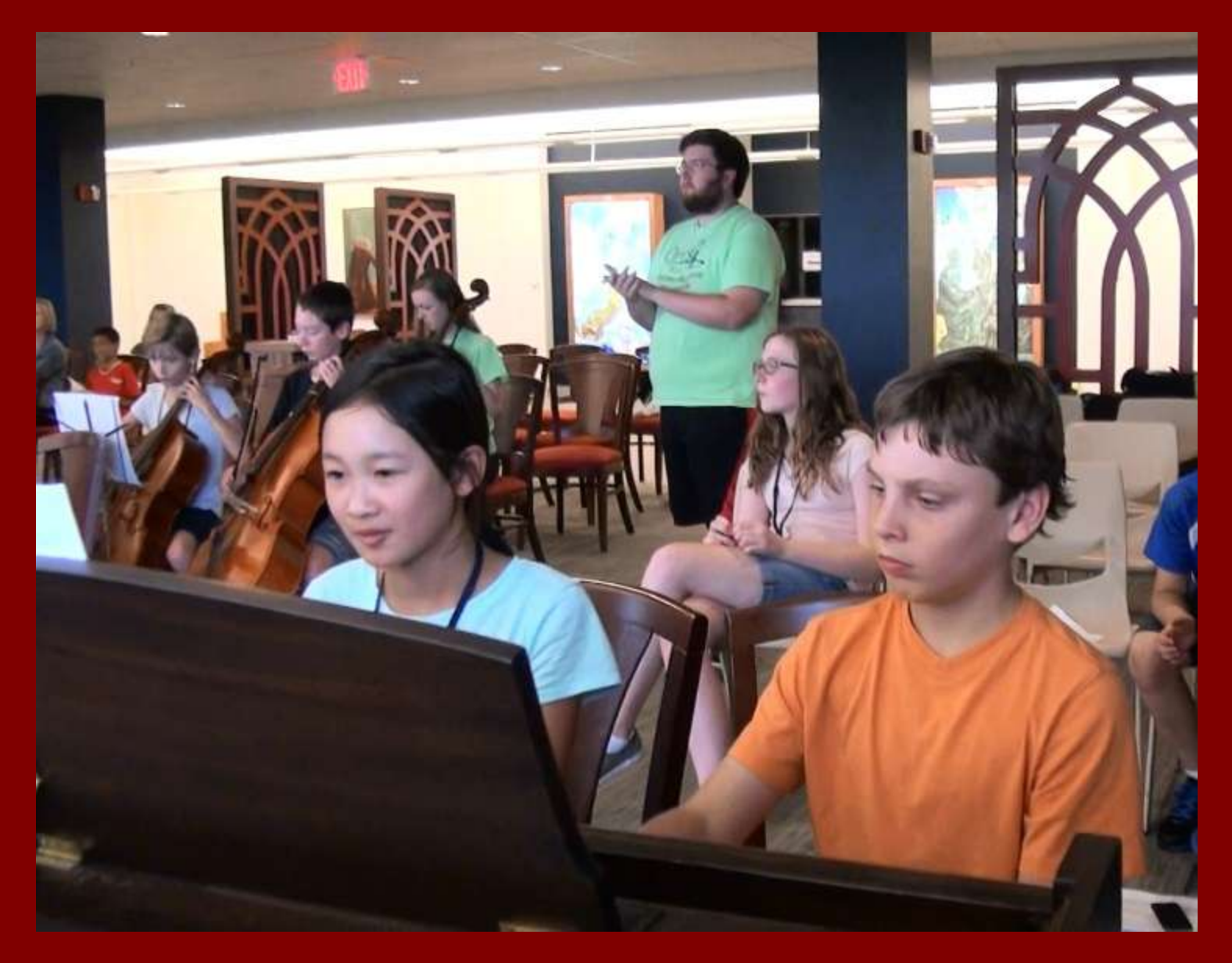
Viva Mexicana – Cello, Bass are the melody; with TA clapping.