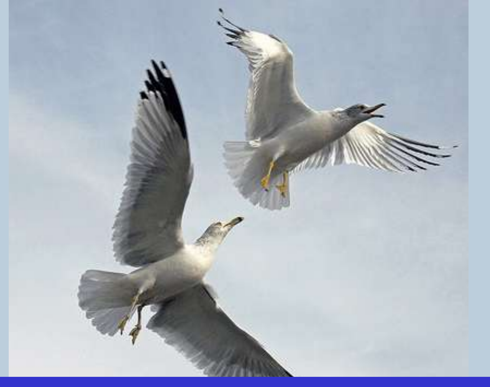
Arts Connections Projects